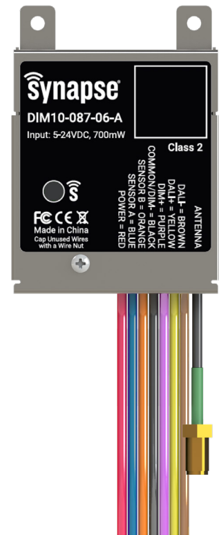
Powered by SimplySnap

The DIM10-087-06-A embedded wireless controller opens an exciting integration path for LED Luminaires. The smaller size and lower cost make this DC-powered wireless controller versatile enough to be embedded in nearly any wattage LED Luminaire. Pairing the DIM10-087-06-A with a SimplySnap Site Controller makes it easy to comply with ASHRAE, Title 24, DLC NLC Indoor/Outdoor, and other energy requirements today and in the future.